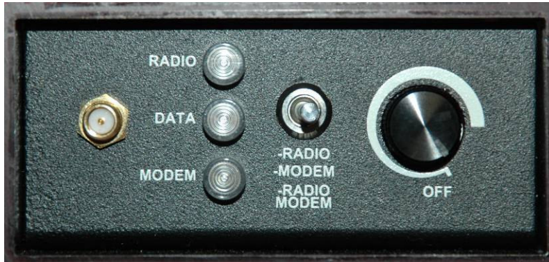
Front Face – Antenna port, Status and Controls