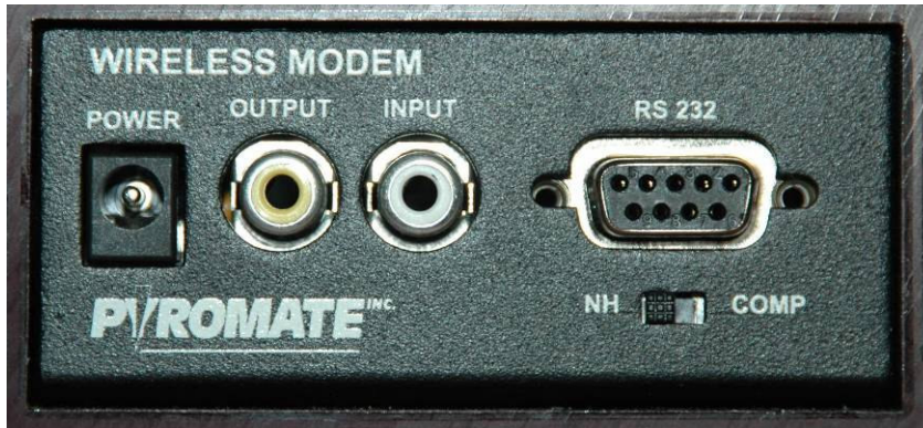
Rear Face – Inputs, Outputs and NH/COMP switch